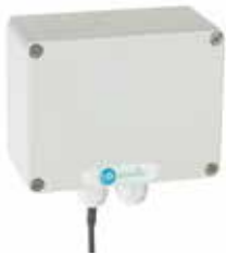
LGMT434 Genesis Masthead Receiver