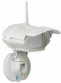
Genesis LGWP Wireless PIR Detector