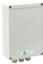
LGIP MT434 Genesis IP Masthead Receiver