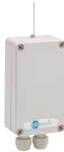
LGTX434 Wireless Genesis Transmitter