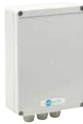
LGMRU4x4 Masthead Receiver with Relays

For more information see separate datasheets