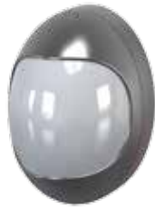
Genesis 2 Wireless PIR Detector