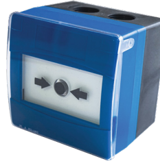
NXICP - Red/Blue