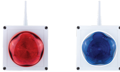
NXISB / NXESB - Red/Blue

Internal/External call-point with sounder/beacon in red/blue