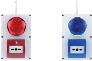
NXICSB / NXESB - Red/Blue

Internal/External call-point with sounder/beacon in red/blue